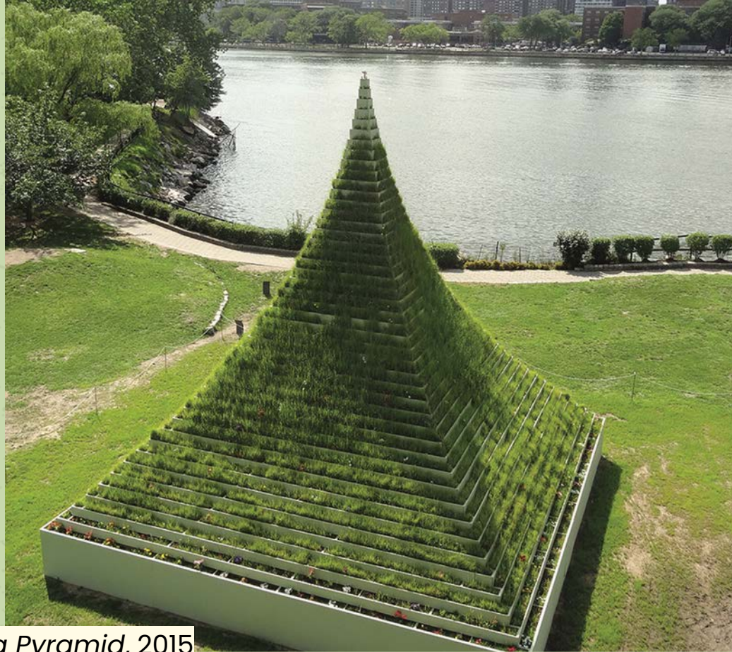
Agnes Denes, The Living Pyramid , 2015