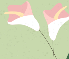
The Labyrinth Trail, UCSP