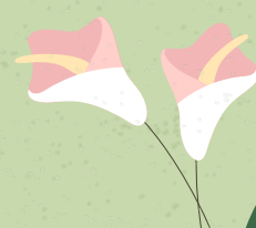
Andy Goldsworthy, Untitled